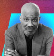
BISHOP NOEL JONES NCSO DIOCESAN

LOCATION - CHRIST TEMPLE 9000 LA RIVIERA DR, SACRAMENTO, CALIFORNIA 95826